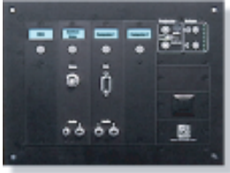
SP-2 CHAS and accessories