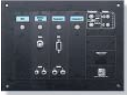
SP-2 CHAS and accessories